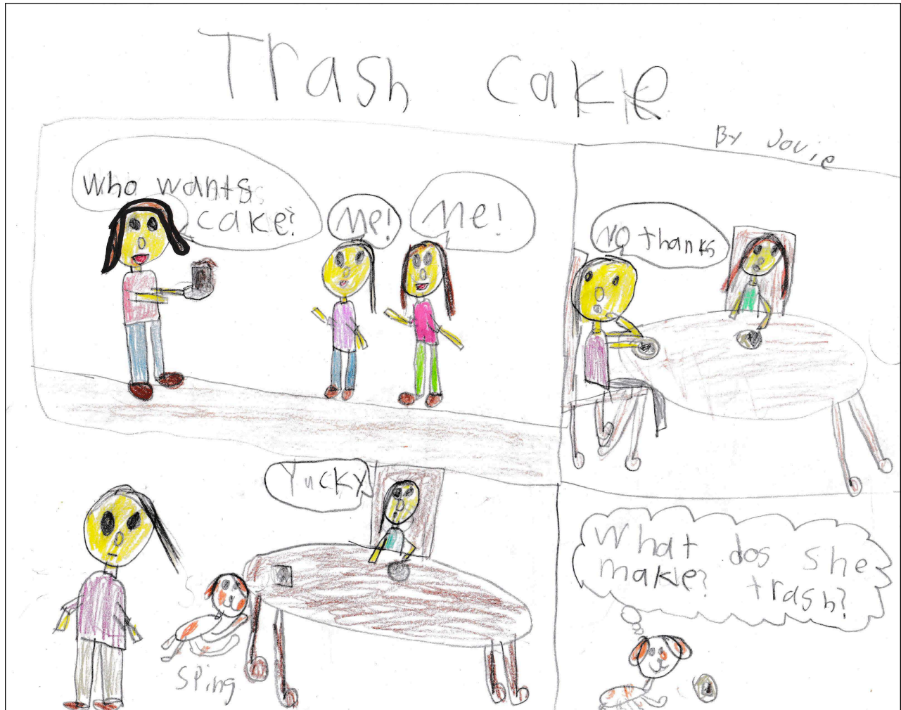
By JOVIE J. Second Grade

If you wanted to add something to the newspaper, draw or write it here! You can share your drawing with us for the next issue!