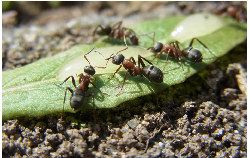
Ants at work.

The queen is the mother of all the ants and seems really lazy. When she is old enough, she flies out of the nest where she was born, finds a place to make a nest, digs a hole in the ground, and lays eggs. Then, when her kids are old enough, they do the rest of the work while the queen just lays